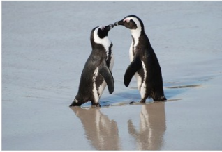
Penguins at Boulders Beach