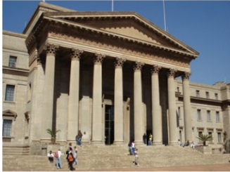
University of Johannesburg